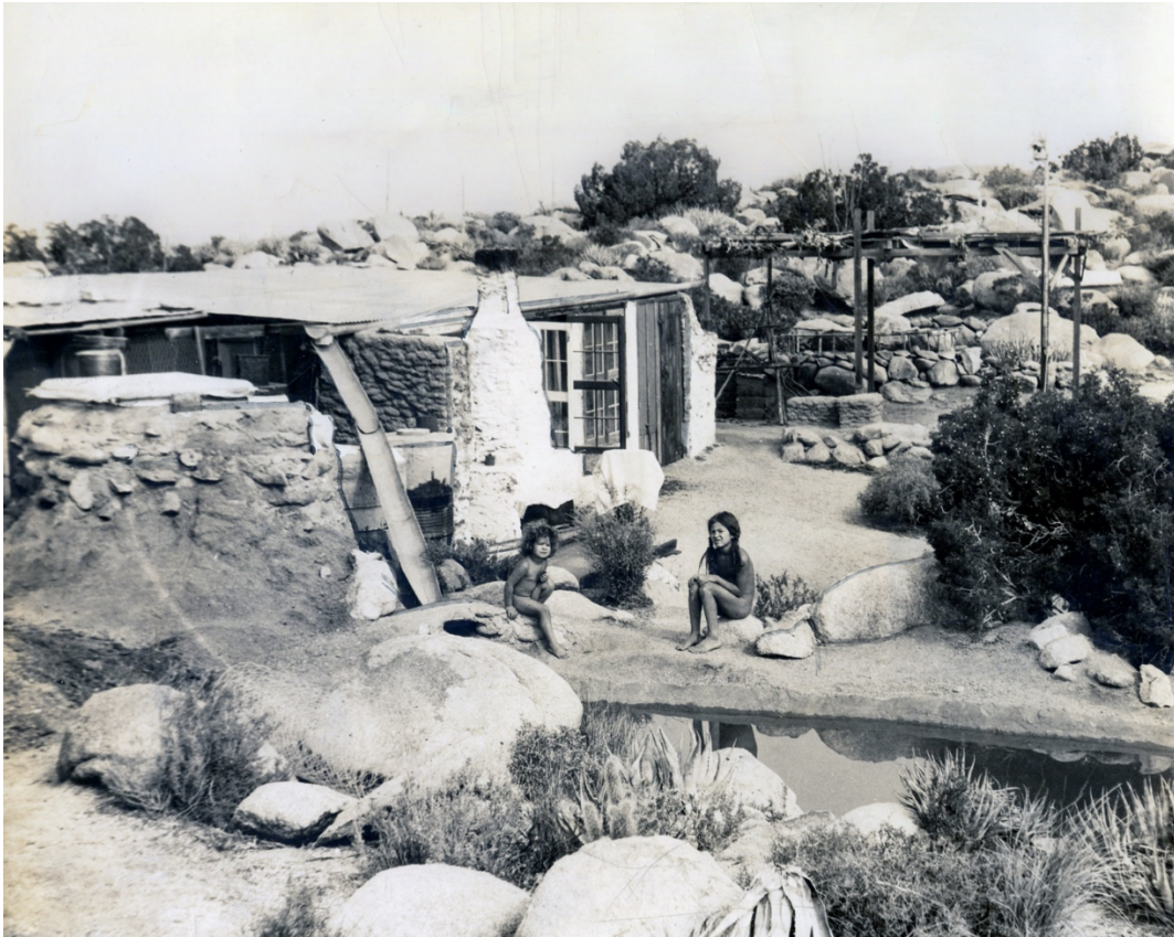
Figure 3. The South's home on Ghost Mountain. Rudyard (L) and Rider (R) sitting next to Yaquitepec's seasonal pond.

Black and white photographs of the South's children, sitting naked on granite boulders outside their home or making pottery under a shaded patio with their father, are haunting. It is easy to imagine them laughing as they hop from boulder to boulder or snuggled up under blankets listening to their parent's stories by the glow of the kitchen's hearth, with the sounds of the desert night filtering in under the front door. The image gnaws somewhere within the heart, like an ill-defined longing that just won't go away. The broken commitment to see it through to the end and the sudden interruption of innocence, no matter the reason, hurts inside and disturbs the secret hope that someone somewhere is still able to escape the rat race. If only for just an hour, a day, or for 16 years.