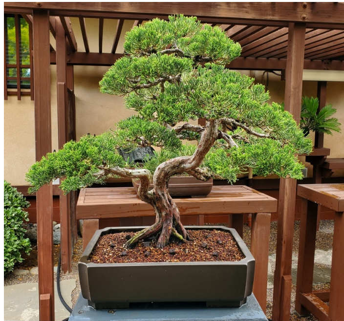
Figure 1. The bonsai as a metaphor for our natural heritage. A juniper bonsai at the Japanese Friendship Garden in Balboa Park, San Diego.

The allure we feel for the Peninsular Range, for any wildland unfettered by the trappings of civilization, is atavistic. We are drawn to wilderness because it is where we came from. It is our home.