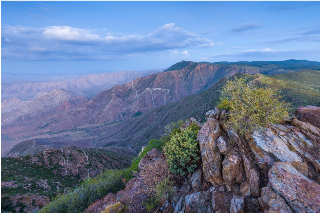
Figure 9. The Laguna Mountains escarpment. Looking southeast from Garnet Peak into the Anza-Borrego Desert.