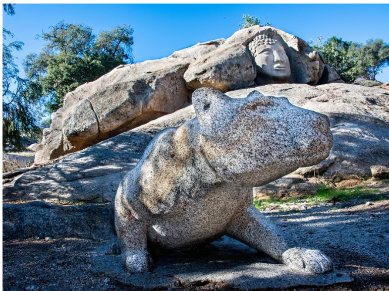
Figure 7. The lion and the Buddha. Stone statues carved by Duncan McFetridge outside his home.