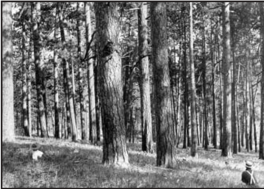
Forest conditions in the Lick Creek area of Montana's Bitterroot National Forest, shown in 1909 immediately before logging.