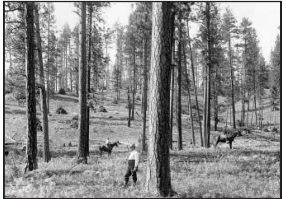
Cleanup operations on the Bitterroot National Forest's Lick Creek timber sale in 1909, falsely presented by the Forest Service as showing historic forest conditions.