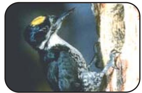
Black-backed woodpeckers are uniquely adapted to thrive in recently burned forests and favor areas which are not logged following a fire. They feed on the larvae of wood-boring beetles and may consume over 13,000 annually, helping to naturally control insect populations.

This publication explores the important role of wildfire in our forests and outlines steps that homeowners and communities should take to prepare for the inevitability of wildfire. It also examines the relationship between logging and wildfires, issues surrounding post-fire logging, and historical forest conditions.