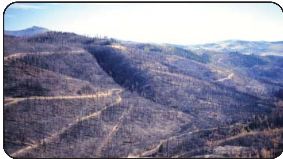
Plum Creek Timber Company lands near Missoula, Montana that burned in the 2003 Mineral Primm fire clearly demonstrate that years of logging and roadbuilding did absolutely nothing to slow the spread of fire. You can see why firefighters who fought this fire dubbed Plum Creek's lands the "Black Desert." If logging reduces the risk and intensity of wildfires, as some claim, why do Plum Creek's lands look like this?

- U.S. Department of Agriculture Pacific Northwest Research Station: Historical and current forest landscapes in eastern Oregon and Washington (1995)