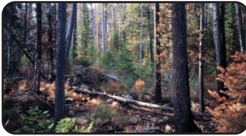
As this mosaic burn illustrates, forests are not destroyed or lifeless following a fire. Burned, dead and dying trees play an essential role in forest recovery after a fire, and scientific research has demonstrated that logging of burned trees harms the natural recovery process.