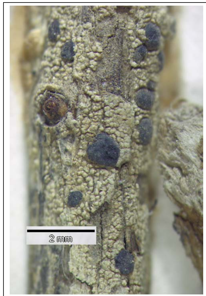
The possibly extinct lichen, Bacidia jacobii . The dark oval shapes are the apothecial discs or permanent fruiting bodies of the lichens.