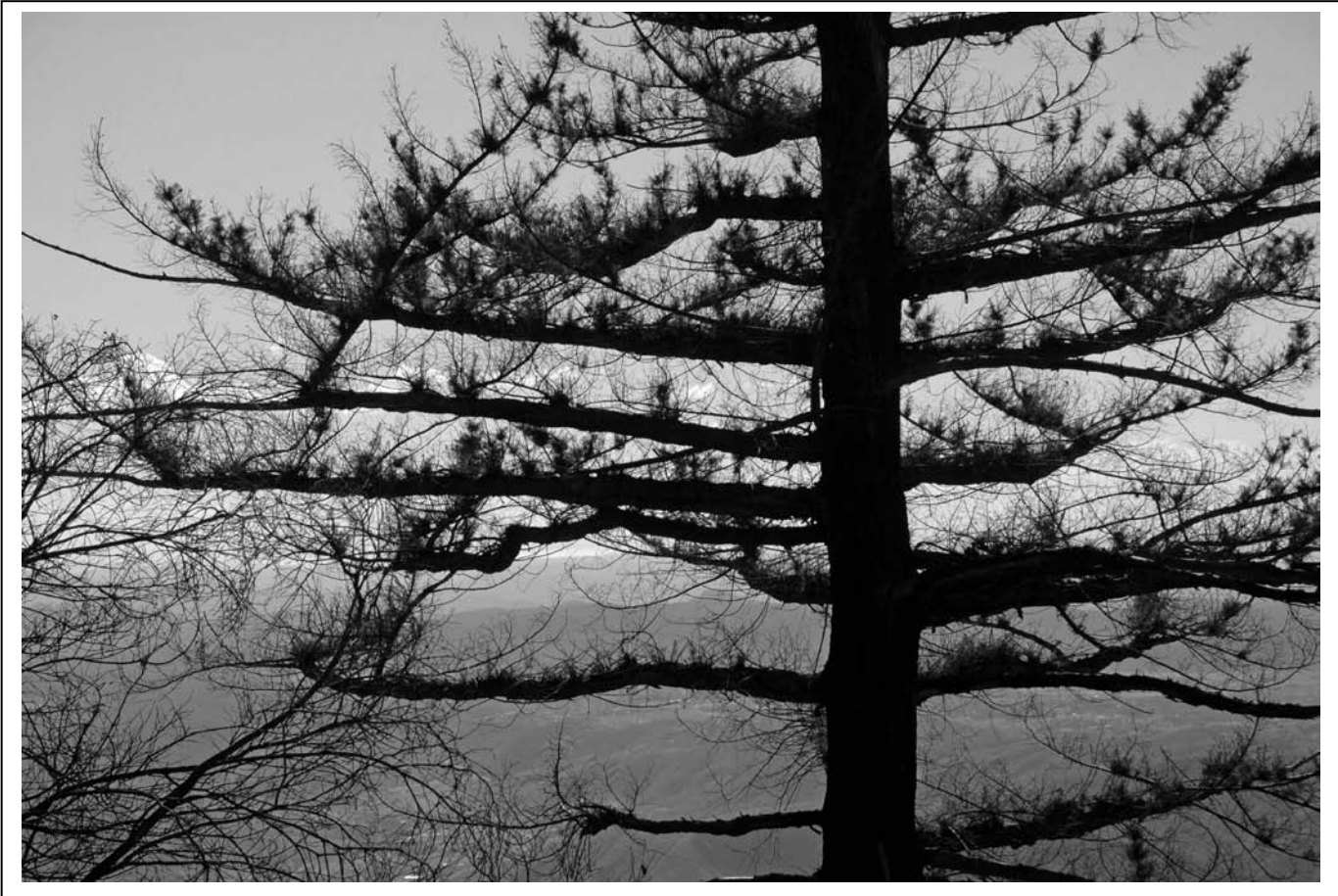
Bigcone Douglas-fir resprouting after a fire.

“People are stupid,” Cody said as he stomped into the tiny kitchen and pulled open the refrigerator: beer, sprouts, goat cheese, a jar of peanut butter, and some