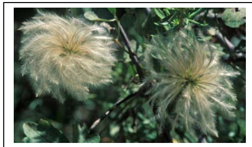
Ropevine with seed fluffs

A stripped stretch of land For the fluff to grow and to bring more specks of fluff