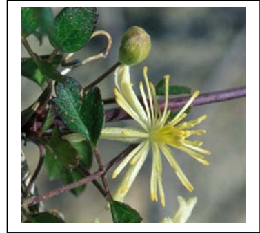
Ropevine ( Clematis pauciflora ) in bloom

And then from the back a small voice sighed. "Please," asked the child, "Can we go play outside?"