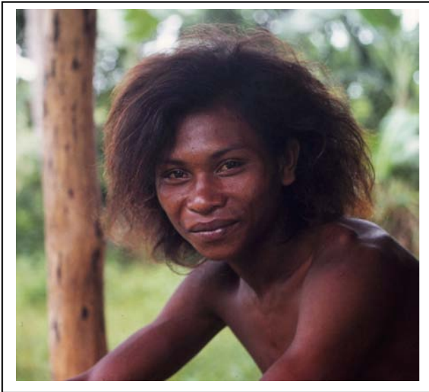
A young Ati man on the island of Panay, Philippines. The Ati are the original inhabitants of the islands. After centuries of persecution, very few are left.

You don't have to ask a child about happy, you see it. They are or they are not. Adults talk about being happy because largely they are not. Talking about it is the same as trying to catch the wind.